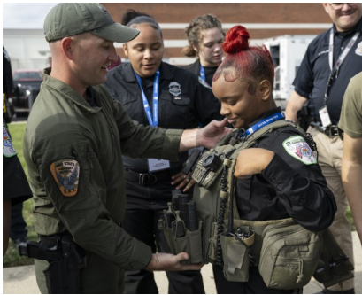
Demonstrations from our 2023 Central Ohio Teen Summit.

We are happy to say that the inaugural Teen Summit was a smashing success. The feedback was overwhelmingly positive, and it helped to strengthen the relationship between law enforcement and teens. This event serves our communities as it will instill the importance of self-care and public service.