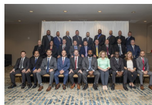
PELC Class 86 Graduation Picture