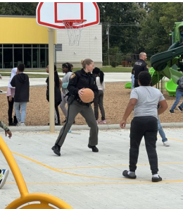
D.A.R.E. Officers interacting with school children.

Generous support of the Law Enforcement Foundation's D.A.R.E. Officer Training (DOT) Class 76 enabled LEF to train and certify 24 new D.A.R.E. Officers to teach students throughout Ohio on the dangers of alcohol and drug abuse. D.A.R.E. is being taught by 119 police departments all over Ohio.