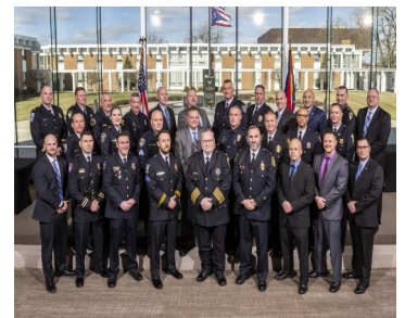
CLEE Class 27 Graduation Picture

use as an idea resource and example for execution in their own departments. The capstone studies tackle issues within the police department and the local community with a detailed solution strategy to implement. This is an invaluable tool for any police agency.