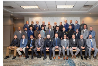
STEP Class 29 Graduation Picture

Today, there are 944 STEP graduates making a positive contribution towards the safety and welfare of their communities. We wish the best for our 69 STEP graduates in their leadership roles that influence new generations of law enforcement agents every day.