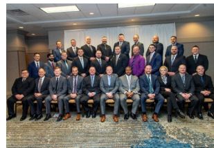
PELC Class 84 Graduation Picture

Today, there are 2,552 PELC graduates making a positive contribution towards the safety and welfare of their communities. Best wishes to our PELC 91 graduates in their future endeavors of serving their departments and protecting their communities!