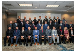
PELC Class 85 Graduation Picture