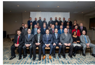
STEP Class 30 Graduation Picture