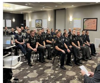
D.A.R.E. Officer Training (DOT) Class 76

Upon their successful completion of the 80 hour training, which concluded with graduation on September 29th, the 21 new D.A.R.E. Officers are now prepared to teach drug and alcohol prevention education. The LEF has trained 1,841 officers so far for Ohio.