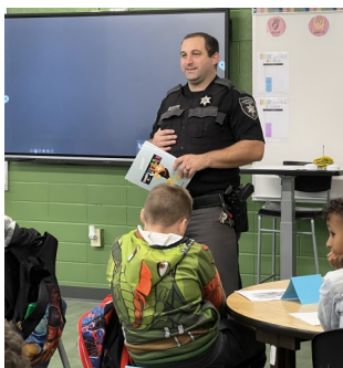
In-school training sessions for potential D.A.R.E. Officers.

D.A.R.E. America is undergoing a review and will also plan on updating the keepin' it REAL curriculum. The review will include a new curriculum involving vaping and bringing the videos used in the classroom up to date for the new generation!