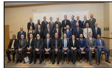
2024 PELC Graduation Pictures for the winter, spring, and fall classes.