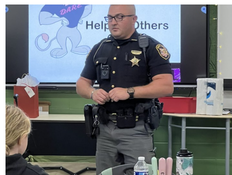
Images from D.A.R.E. Officer Training Class 77