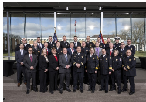
CLEE Class VIII Graduation Picture