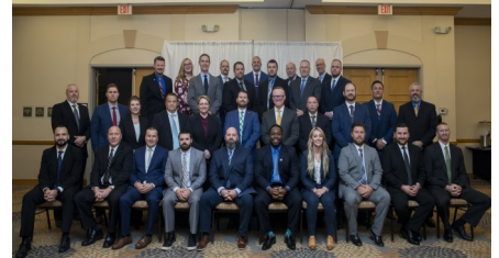
2024 STEP Class 31 & 32 Graduation Pictures

"PELC presented an opportunity for me to come together with other police leaders to navigate complex challenges that each of us face at our agency's and within our communities."